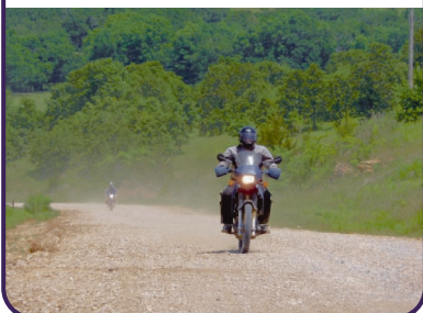
above images taken at the 2011 Stampede